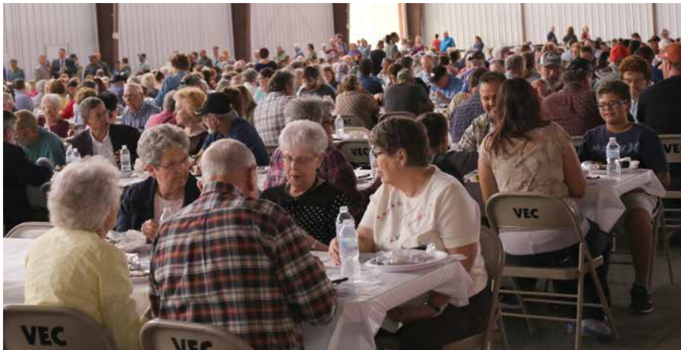
More than 900 people enjoy a steak dinner at the 73 rd Annual Meeting held at the Western State Bank Expo Center.

Every year, Victory Electric looks forward to hosting the annual meeting for our members, and this year was no exception. The annual meeting is a great time to get to know our members and to offer information on the activities of the cooperative.