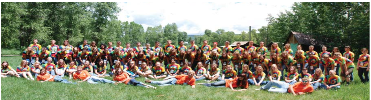
The students from Kansas, Oklahoma, Colorado and Wyoming who participated in Cooperative Youth Leadership Camp.