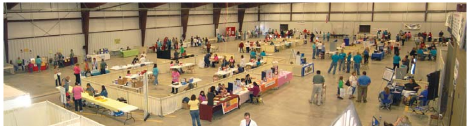
A couple thousand people attended the 2010 health fair. This years event will be on Oct. 1 and is open to the public, free of charge.

The fourth annual Victory Electric Health Fair is just around the corner.