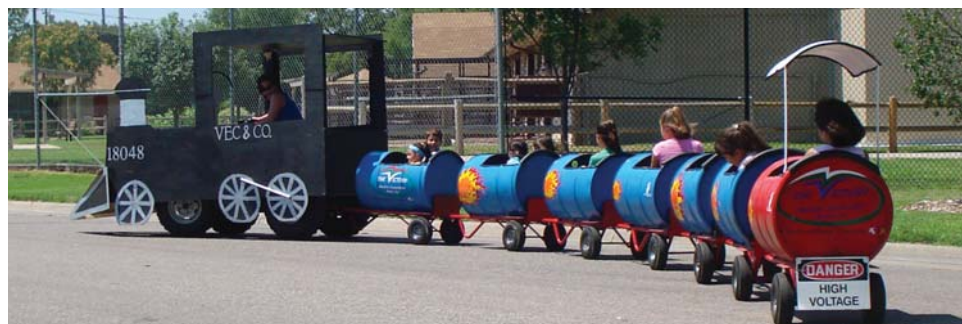
Victory participated with our train at the McDonald's KidsFest during Dodge City Days.

This is one of our favorite times of the year.