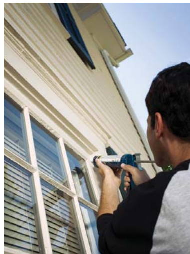
Sealing air leaks in your home can save you energy and money—up to $212 a year!

and the temperature is above 45 degrees F. In addition to caulk, you can use low-expansion spray foam to seal leaks.