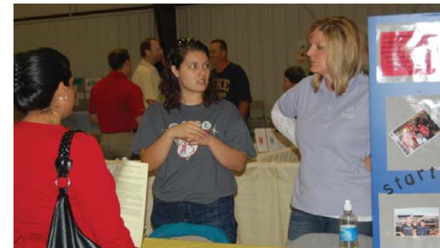
The Big Brothers Big Sisters program's booth encouraged health fair participants to be youth mentors.

Victory Electric is already looking forward to the 5th Annual Community Health Fair, and we hope to see everyone there.