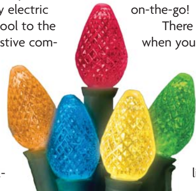
LED lights make great Christmas gifts and can help save money!

There are many options when you start looking for green gifts. Get creative, and remember that what you give impacts future electric bills. So give the green light for energy-smart gifts this year!