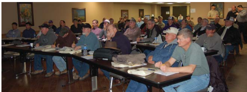
Members attend the 13th Annual Irrigation Seminar.

Victory Electric's 13th Annual Irrigation and Technology Seminar had a great turnout on February 11, 2011.