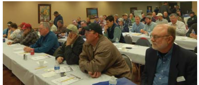
Members attend the 12th Annual Irrigation Seminar.

We encourage all area irrigators to look for their invite next year and attend the 13th Annual Irrigation and Technology Seminar.