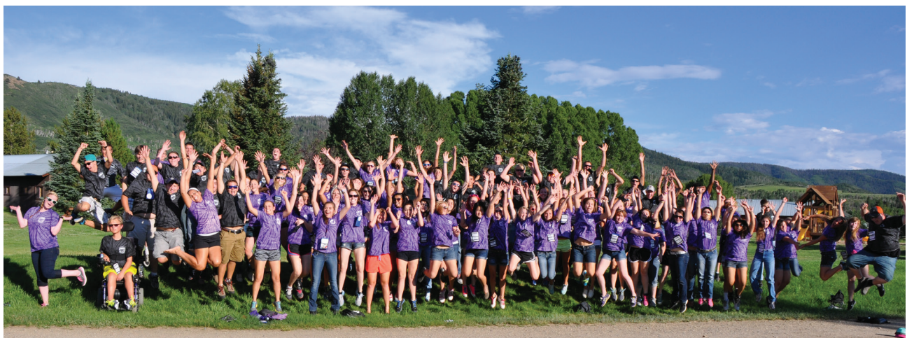
The 2013 Cooperative Youth Leadership Camp delegation included more than 100 students who couldn’t contain their excitement when posing at their camp in Steamboat Springs, CO.