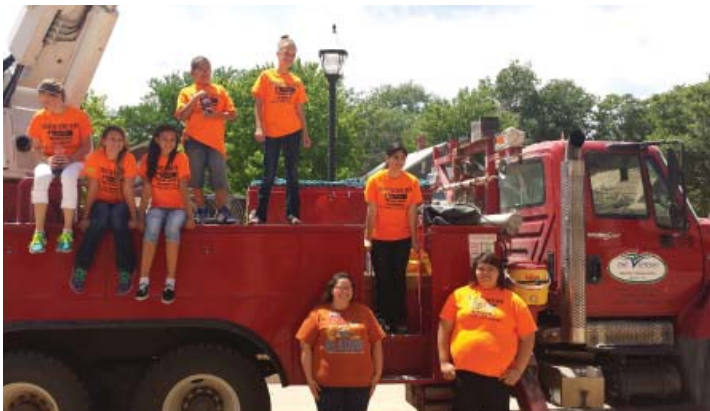
Some of the library volunteers at the event gathered for a photo on Victory Electric's bucket truck.