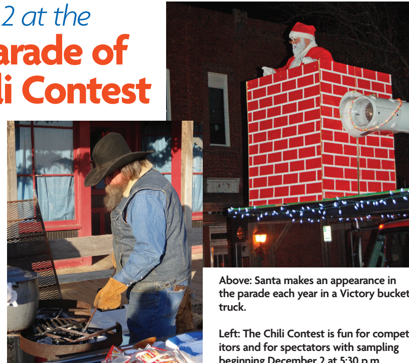
Above: Santa makes an appearance in the parade each year in a Victory bucket truck.