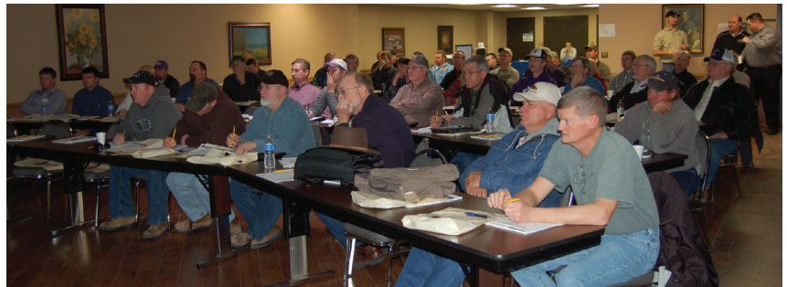
Members attend the 13th Annual Irrigation Seminar.

Victory Electric's 13th Annual Irrigation and Technology Seminar had a great turnout on February 11, 2011.