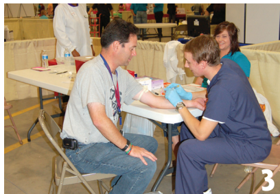
1. Clark County Sheriff's Office presented the Fatal Vision Program. 2. Dodge City Medical Center checked blood pressure. 3. Approximately 200 people had their blood drawn. 4. Volunteers from Victory Electric. 5. The Trolley, donated by the Dodge City Convention and Visitors Bureau, shuttled people from parking lots to the Health Fair entrance. 6. Hundreds of people attended the 3rd Annual Victory Electric Health Fair.