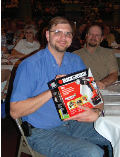
Members who attended won many great prizes including this cordless drill.