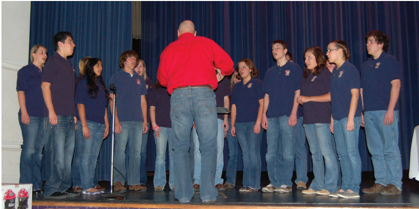
The Dodge City High School Madrigals performed two songs and the National Anthem.