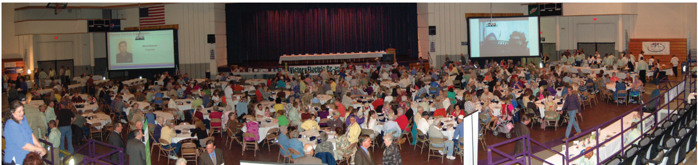
Approximately 600 people attended Victory Electric's 65th Annual Meeting at the Dodge City Civic Center on April 6, 2010.