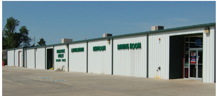
Weece's Furniture Outlet is located on south Second Street in Dodge City.

Weece Furniture Outlet, Don and Michael are an impor-