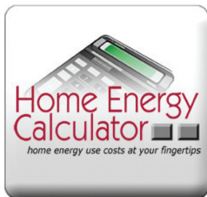
The Home Energy Calculator button on our Web site will guide you to the tv calculator and many others

Victory Electric recognizes the growing trend in TV energy use. That's why you'll find a special "TV Calculator" included in the new Home Energy Calculator located on Victory's Web site www.victoryelectric.net . Just click on the Home Energy Calculator icon