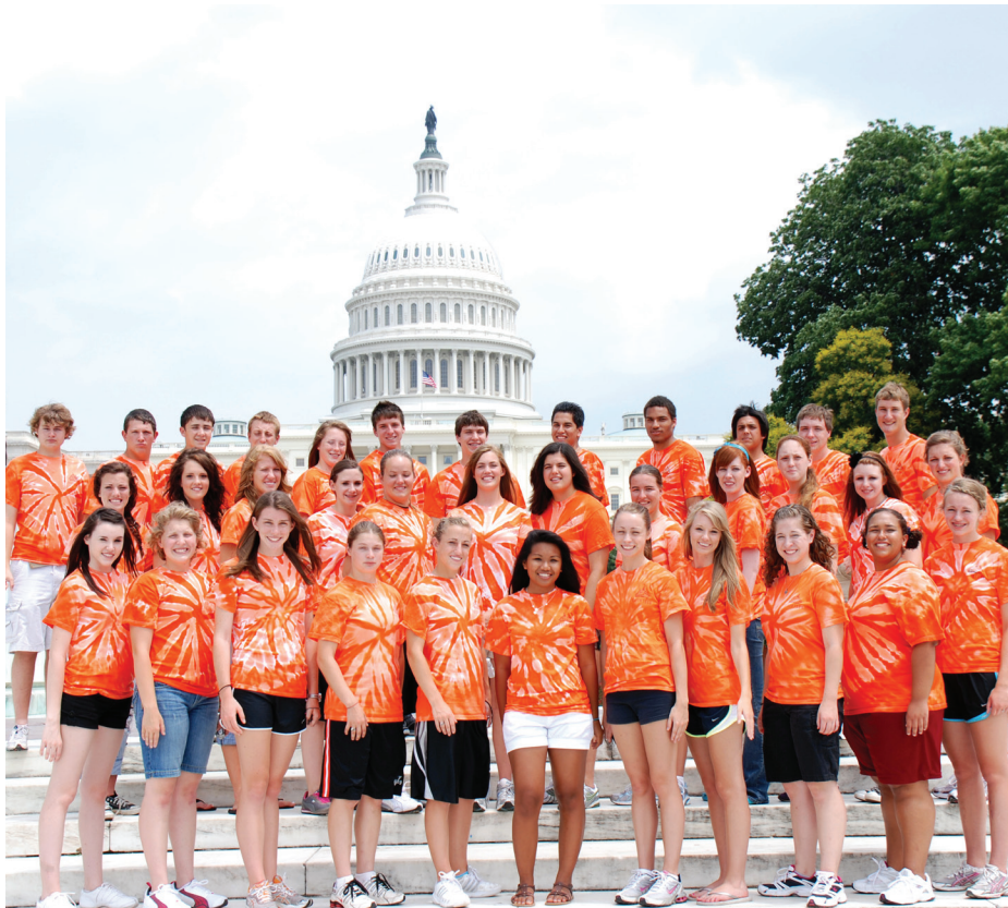
The Kansas and Hawaii Youth Tour students pose in front of the US Capitol.