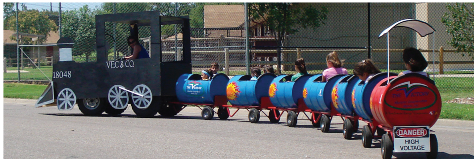
Victory participated with our train at the McDonald's KidsFest during Dodge City Days.

This is one of our favorite times of the year.