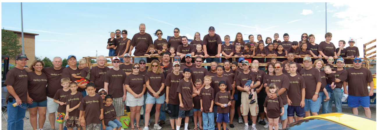
Left and below: Victory Electric employees and their families participated in the Dodge City Days Parade on July 25, 2009.