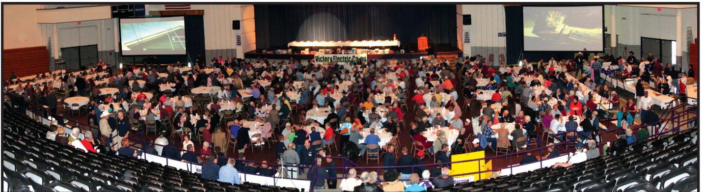
Approximately 700 people attended Victory Electric's 64 th Annual Meeting at the Dodge City Civic Center on April 14, 2009.