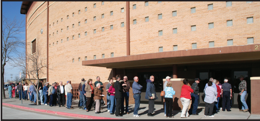
Members arrive at the Dodge City Civic Center to attend Victory's Annual Meeting of Members. Members were served a free meal and dozens of great door prizes were given away.