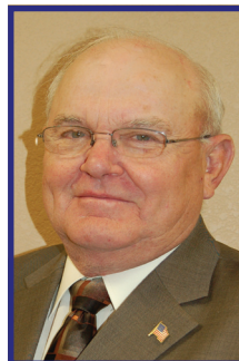
District 3 Carl Hubbell