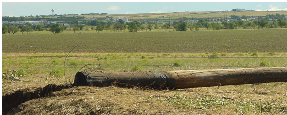
The winds in the storm on June 12 was strong enough to rip this power pole out of the ground.

“Watch carefully for downed power lines and treat every downed line as if it were energized”