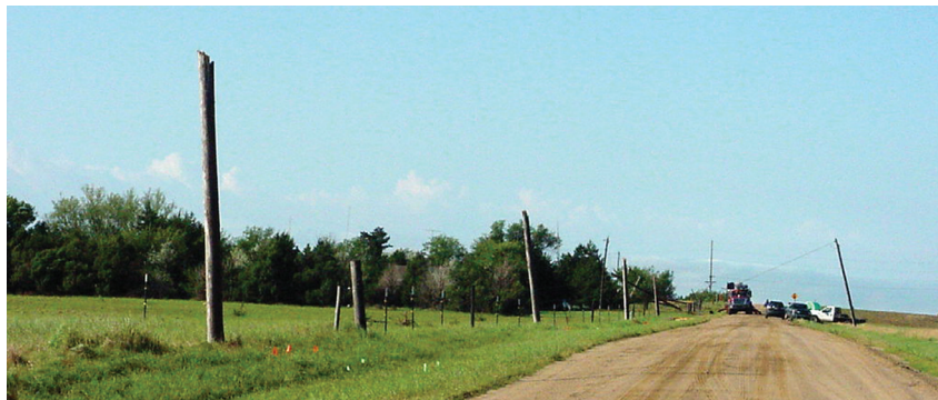
Poles were snapped off from the high winds. It took Victory crews approximately 19 hours to get new poles up and restore power to everyone.