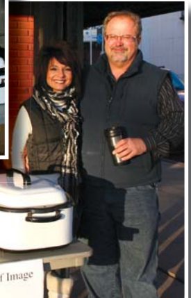
Photos from the Christmas Parade of Lights and Chili Cook-off in Dodge.