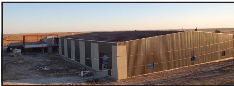
Pictured above: The expansion to Victory Electric's warehouse and offices in Dodge City. This includes a new 150 ft by 210 ft metal warehouse and a new two-story office addition.

The construction at The Victory Electric Cooperative Assn., Inc., is progressing and we are expecting to occupy the new building in the spring of 2009.