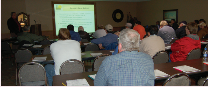
Local irrigators attend last year's meeting at Victory Electric.