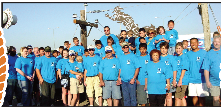
Victory Electric employees and family participated in the Dodge City Days Parade on Saturday, July 26, 2008. In the background is the Victory Electric parade float, which was pulled by a bucket truck. Employees handed out candy along the parade route and cooled off the crowd with streams of water.