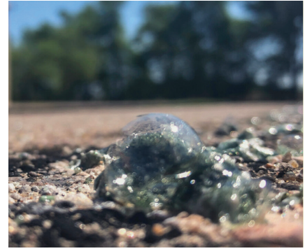
The downed power line was powerful enough to create glass from concrete and create holes and divots in the concrete under the bubbles.

sand is called a fulgurite, and it looks very different from the glass sculptures resembling tree branches in the movie. According to Utah Geological Survey, fulgurites are usually 1 to 2 inches in diameter and up to 30 inches in length. A fulgurite exterior is a hard, crumbly, gray or brown texture and coated in partially melted grains of sand. The inside is a translucent, clear or whitish glass tube.