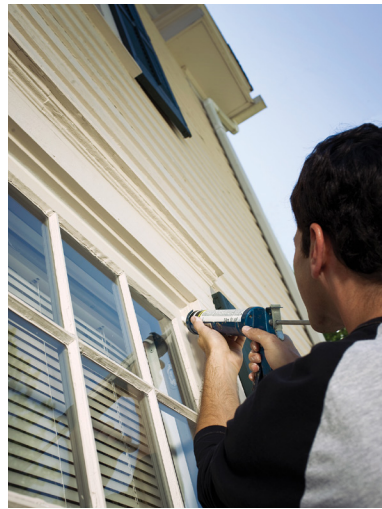
Sealing air leaks in your home can save you energy and money—up to $212 a year!

You can also become a fan of Victory Electric on Facebook at facebook.com/VictoryElectric or by searching for The Victory Electric Cooperative Assn., Inc. Check our page for updates, outage information and energy efficiency tips. Facebook is a great way to stay in touch with our members.