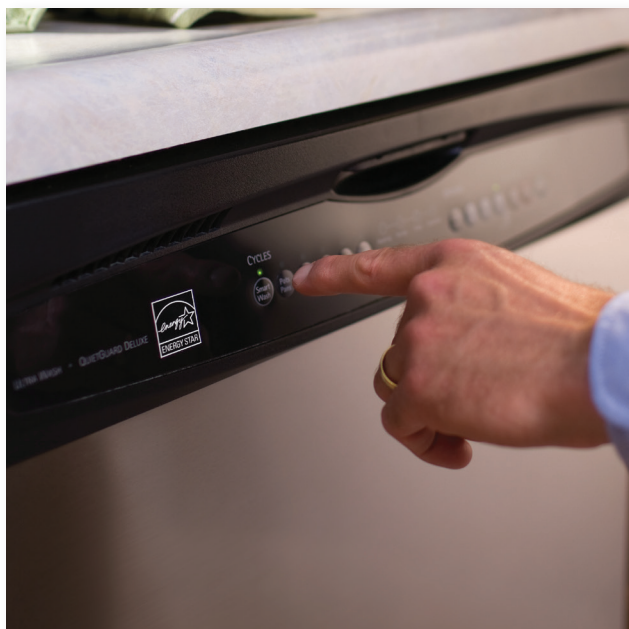
Busca el logotipo de Energy Star cuando la compra de los regalos eficiente.

Hay muchas opciones al iniciar buscar regalos verdes. Ser creativo y recordar que lo que da impactara las facturas eléctricas en el futuro. Por lo tanto dar luz verde es inteligente dar para regalos este año!