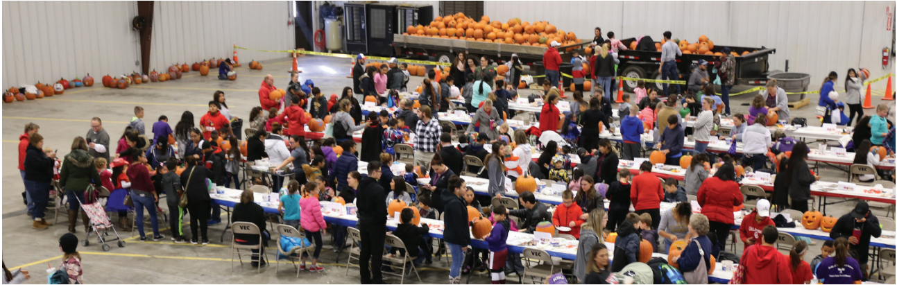
The Annual Pumpkin Painting and Carving Festival was attended by more than 400 area youth and their families.

The 11 th Annual Pumpkin Painting and Carving Festival was held on Oct. 28 at Victory Electric.