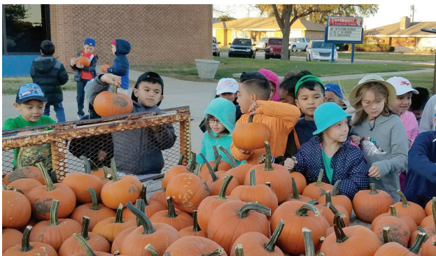
Students from Northwest Elementary choose their pumpkins they want to take home.

Victory Electric donated pumpkins to Northwest Elementary. Each student picked their own pumpkin to take home. This is one way Victory Electric likes