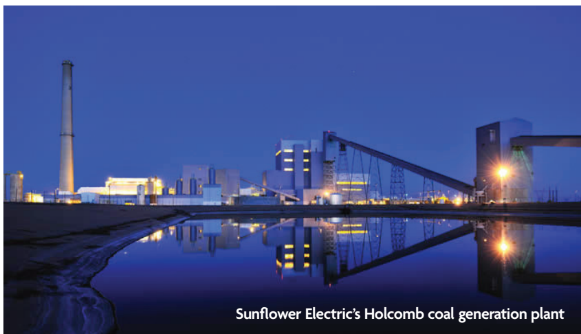
Sunflower Electric's Holcomb coal generation plant

dropped 9 percent since 2014, and co-op solar capacity has increased five times in just the past two years.