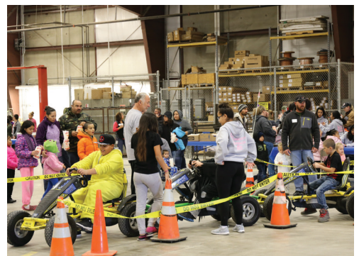
Lines form for the pedal car races.