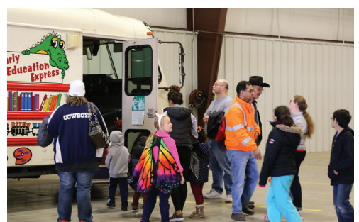
The Literacy Bus provides activities.