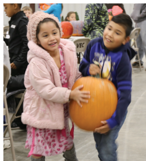
Kids carry their pumpkin to a table for painting.