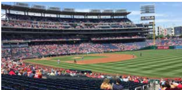
Arjon attends the baseball game with the rest of the delegates.