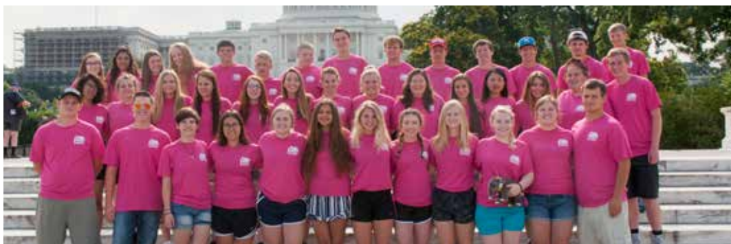
The 2017 Kansas-Hawaii delegation included 40 students who had the opportunity to see memorials, including the White House, on their trip to Washington, D.C., for the Youth Tour.