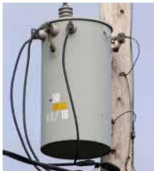
Transformers dirigiendo el tráfico de la eléctrica.

El envío de energía a su casa se parece mucho a conducir a un estado vecino. Usted no considerara la adopción de una carretera secundaria de dos carriles que viajar a una ciudad a cientos de kilómetros de distancia, ¿verdad? Por supuesto que no: Usted encontraría la interestatal más cercana por lo que podría conducir más rápido y llegar a su