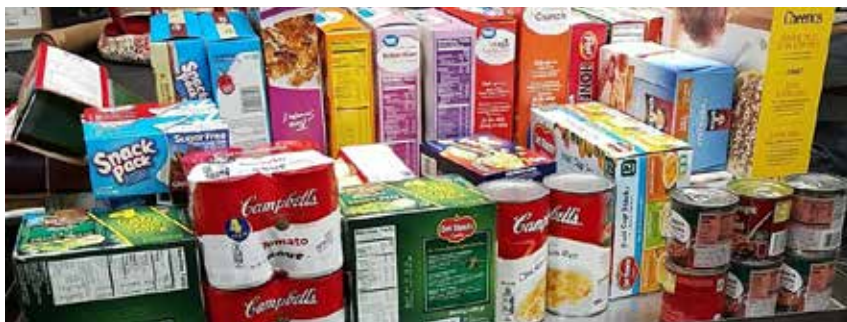
The Dodge City Fire Department donated more than 65 items to Vittles for Vets.

To view a complete list of items, visit ow.ly/OM7Q30dJdla . If you have any questions, call the Victory Electric office.