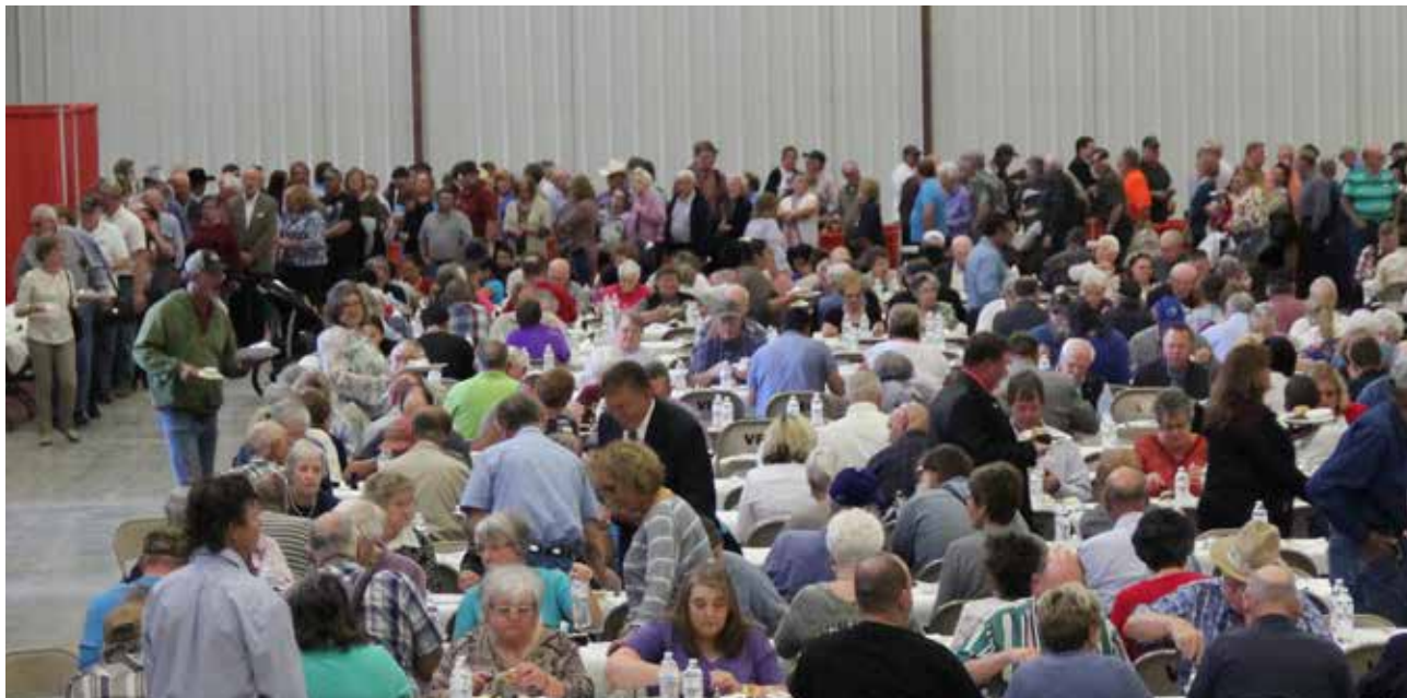
More than 800 people enjoy a steak dinner at the 72nd Annual Meeting held at the Western State Bank Expo Center.

Every year, Victory Electric looks forward to hosting the annual meeting for our members, and this year was no exception. The annual meeting is a great time to get to know our members and to offer information on the activities of the cooperative.