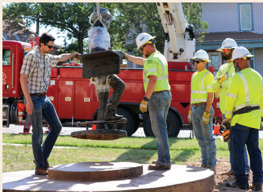
Victory Electric, Ford County Bridge Department and Mendez Construction installed a new bronze statue of Bat Masterson in front of the Home of Stone.

The Ford County Historical Society commissioned the project in 2018. After some delay due to the pandemic, the statue was unveiled on June 19.