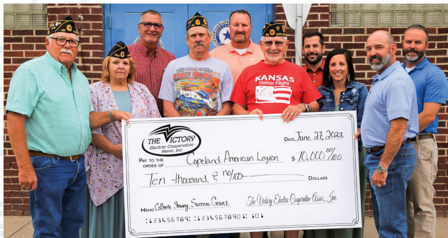
Copeland American Legion members accept the 2022 Victory Electric and CoBank Sharing Success grant.

The legion plans to upgrade their building using the granted funds. The legion membership believes repairs will be a huge benefit to the community, which uses the building for family dinners, reunions, graduation and wedding parties, land sales,