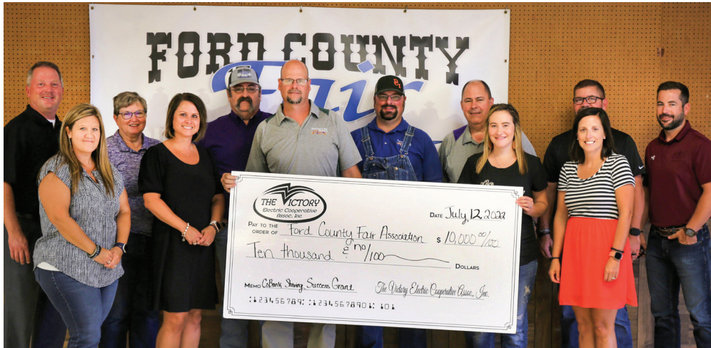
Victory presented the Ford County Fair Association with a Sharing Success grant to help repair and modernize the fair facilities.

business meetings and funeral dinners just to name a few.