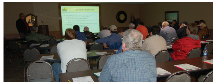
Farmers attend 2010 Irrigation and Technology seminar.