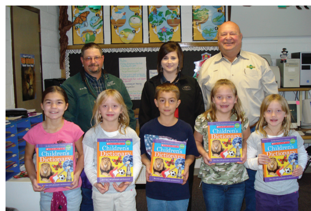
Copeland (left) and Cimarron (right) third graders receive dictionaries courtesy of Victory, Cimarron Rotary Club, and United Telephone.