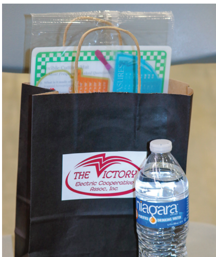
Members in attendance received a $20 bill credit applied to their May electric bill.