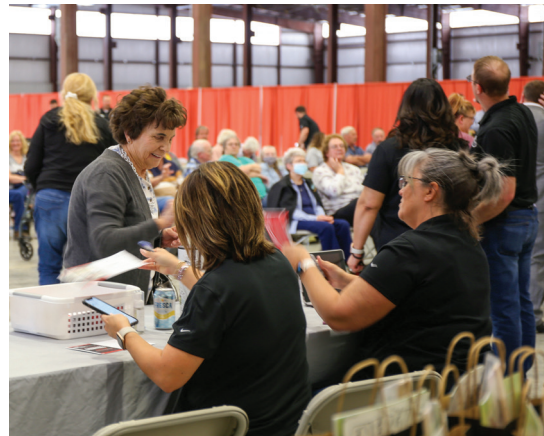
Victory Electric staff help members register and receive their $20 bill credit gift for attending the annual meeting.