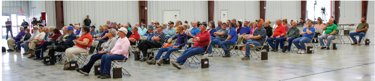
On April 12, 122 individuals were in attendance for the 2022 Victory Electric Cooperative Annual Meeting.

OF THE VICTORY ELECTRIC COOPERATIVE ASSOCIATION, INC.